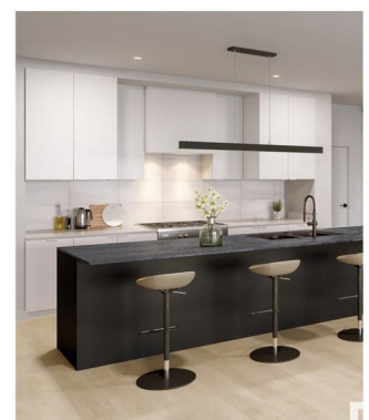
UPGRADE HOOD FAN BUILD OUT VANILLA / FLAT PANEL