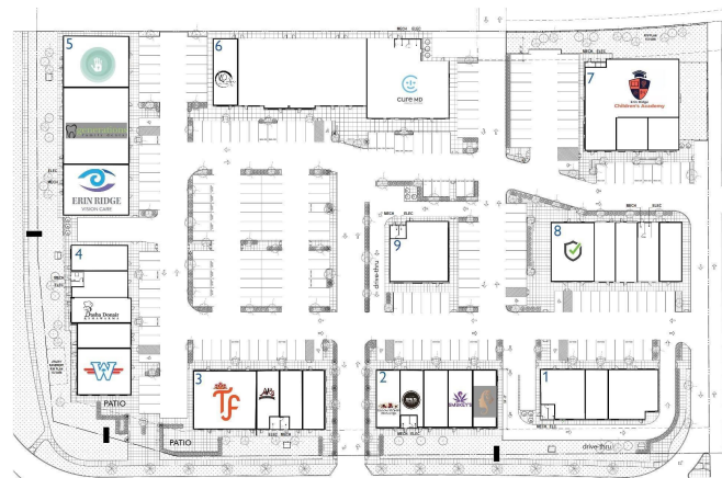
■ Pylon Sign